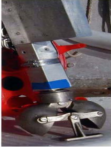
4. Mud Torpedo