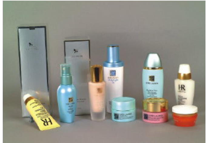
2. Estée Lauder Resilience Range